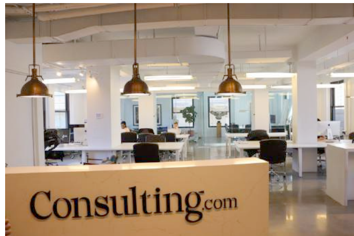
22nd Floor Creative Installation