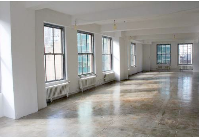
15th Floor Whitebox