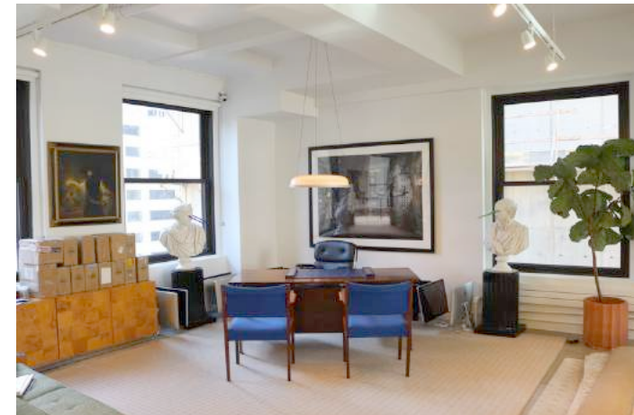
22nd Floor Creative Installation