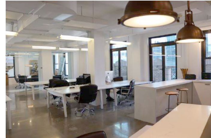
22nd Floor Creative Installation